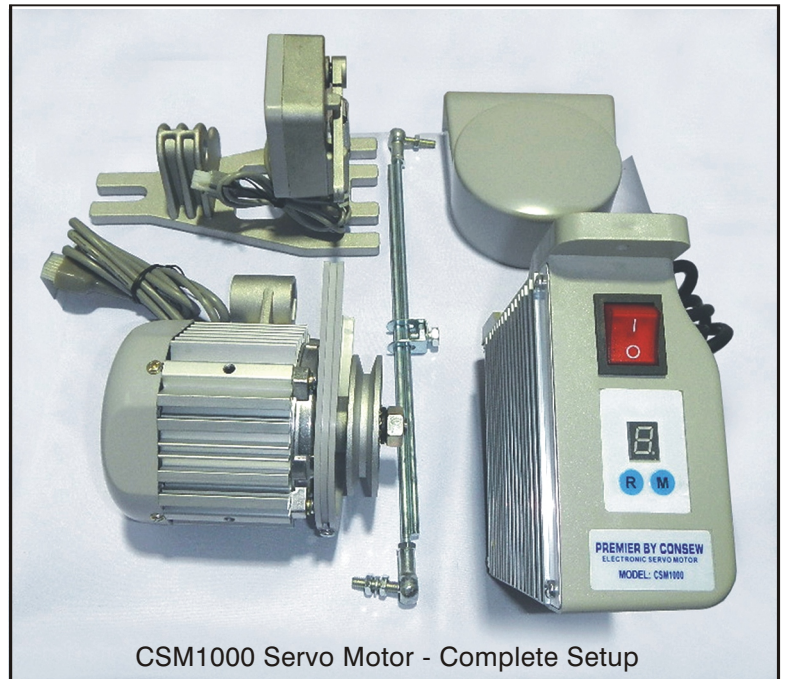
CSM1000 Servo Motor - Complete Setup

Includes power cord and plug (not shown.)