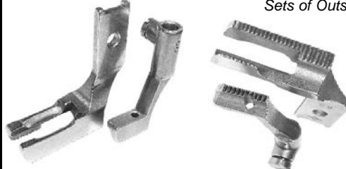
Sets of Outside & Inside Feet

42519Tx20 1/8" 42519x20T 5/32" 42519x20T 3/16" 42519x20T 1/4" 42519x20T 5/16" 42519x20T 3/8"