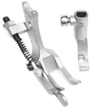
Sets of Outside & Inside Feet

Facilitates straight sewing edge - Adjustable compensating Guide maintains contact with material