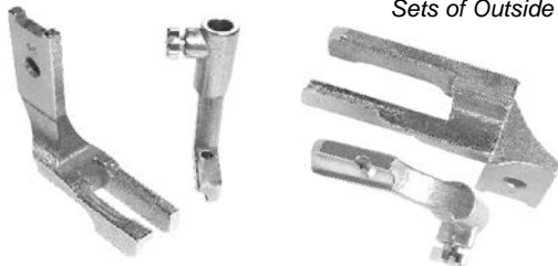
Sets of Outside & Inside Feet

42519x20 1/8" 42519x20 5/32" 42519x20 3/16" 42519x20 1/4" 42519x20 5/16" 42519x20 3/8"