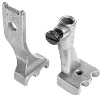
Sets of Outside & Inside Feet