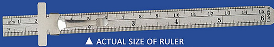
▲ ACTUAL SIZE OF RULER Acid Etched Marking for Accuracy

This Lance® Pocket Ruler is made from a high grade flexible stainless steel. The markings are in millimeters and centimeters on top and inches on the bottom. They are acid etched for superior accuracy when measuring. The reverse side of the ruler has a convenient table of decimal equivalents from 1/64" to 63/64". It's a handy tool for anyone to carry!