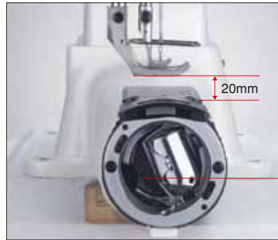
Large shuttle hook