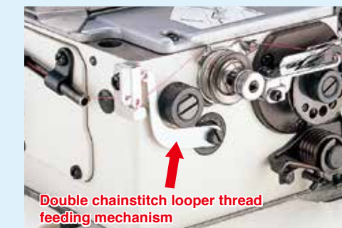
Double chainstitch looper thread feeding mechanism