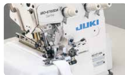
Blind hemming MO-6705DA-0D4-210/L121 (L121: Blind stitch hemming attachment)