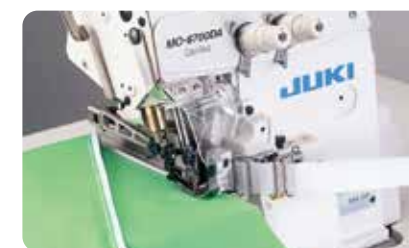
Rolling in tape MO-6745DA-FF4-360/N077 (N077: Clean finish top and bottom)