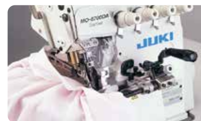
Gathering MO-6714DA-BE6-327/S162 (S162: Swing-type gathering device, manual-lever operated)