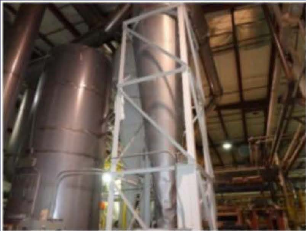
Item 51 – Cyclone Separator (1 of 3)