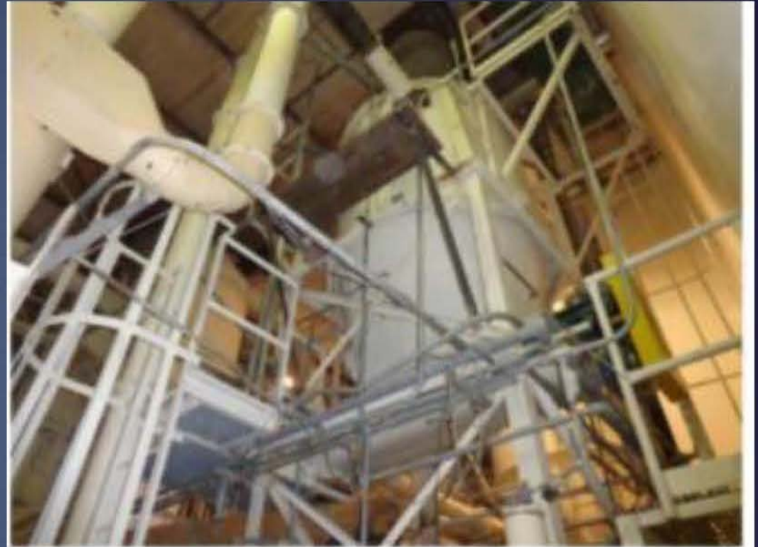
Item 88 – Welded Carbon Steel Feed Hopper