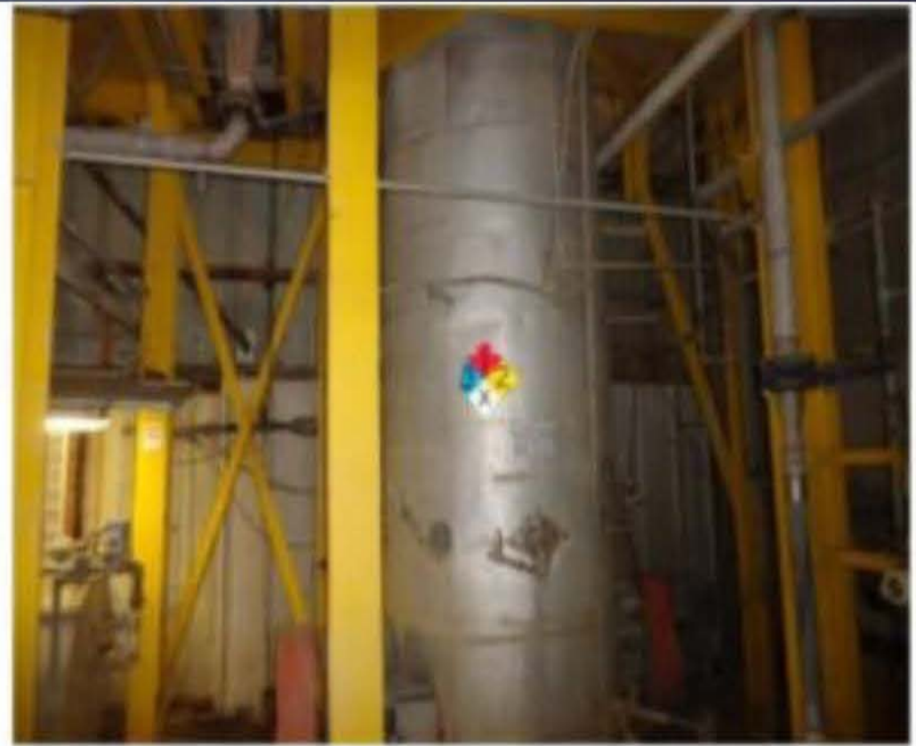
Item 30 – S/S Bleach Tower