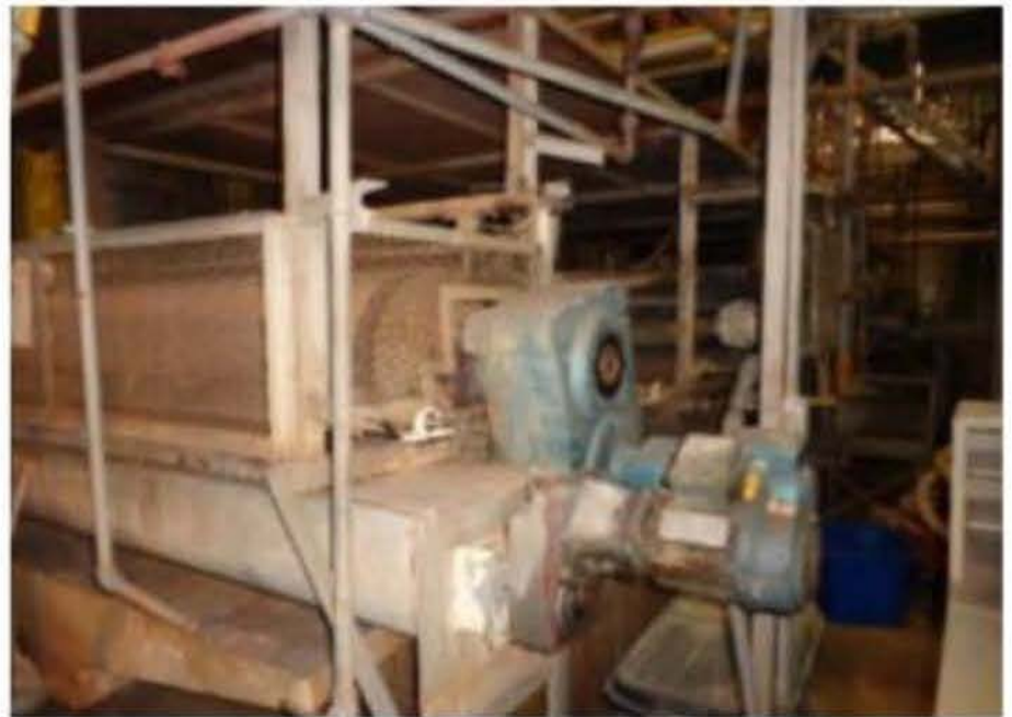
Item 39 – Phoenix Belt Filter