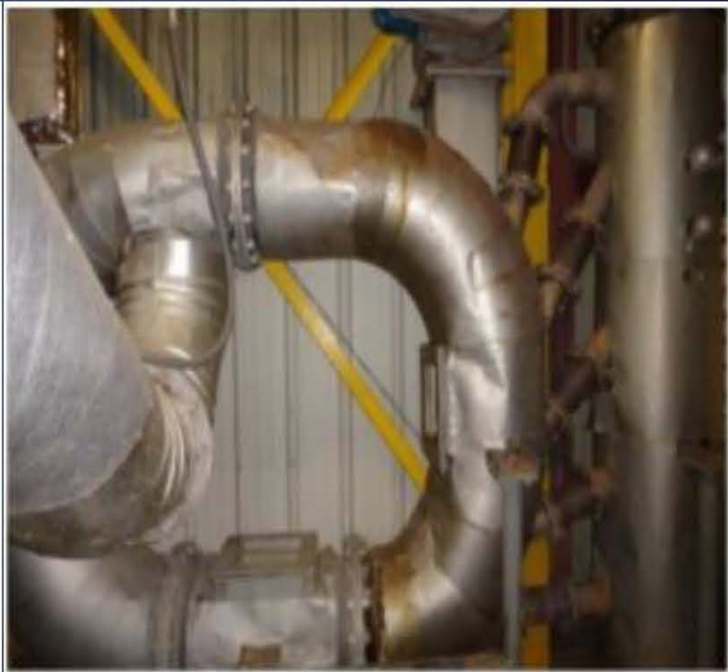
Item 50 – Fluid Energy Aljet Ring Dryer (#2)