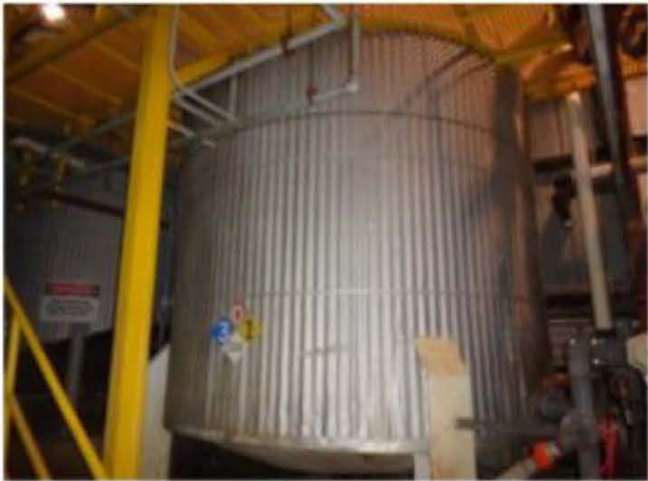
Item 28 – Welded Carbon Steel Storage Tank