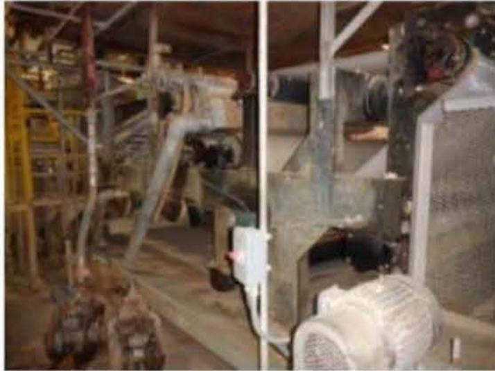
Item 43 – Phoenix Belt Press