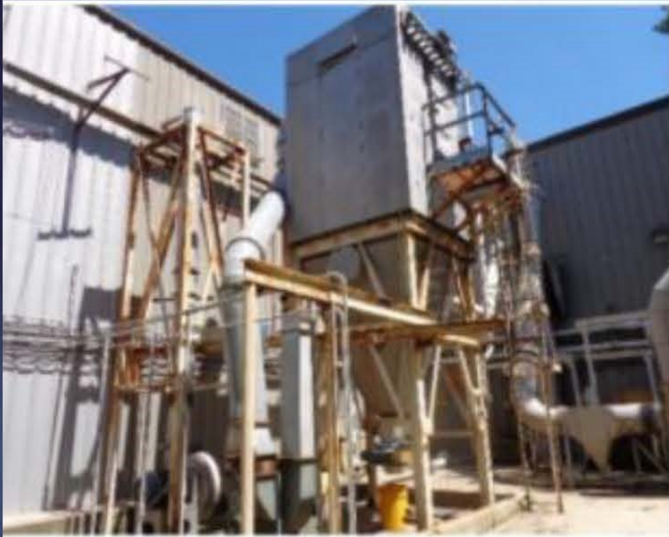
Item 16 – Sly Baghouse Dust Collector