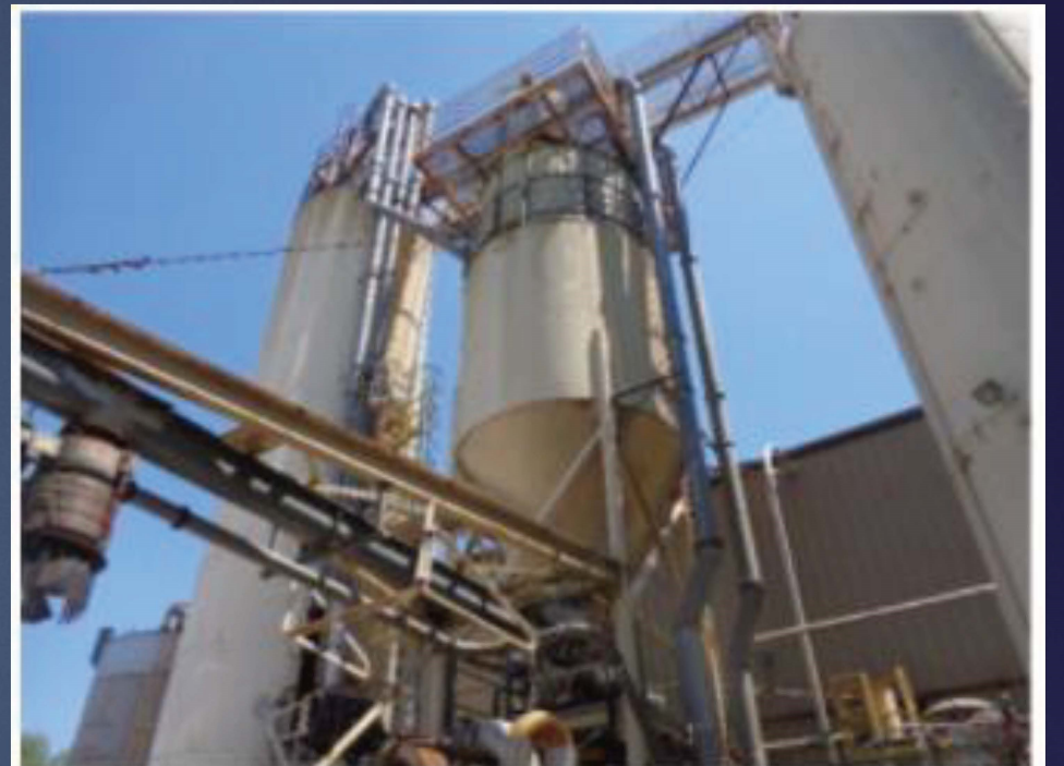
Item 4 – Welded Carbon Steel Silo