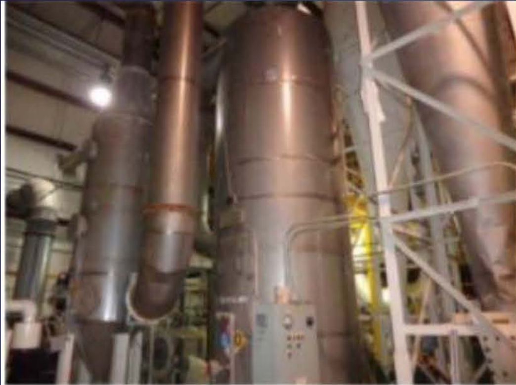
Item 54 – Fisher-Klosterman Scrubber Column