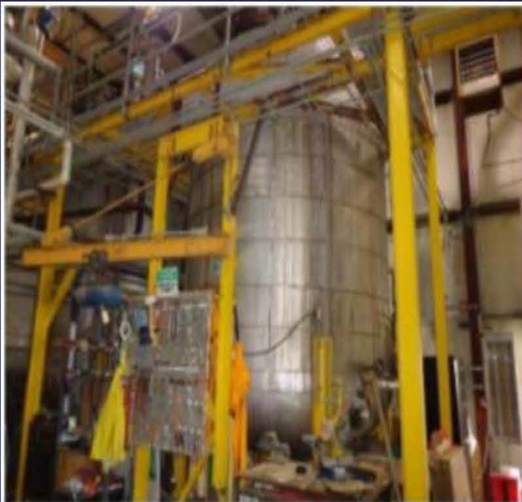
Item 24 – Quality Containment Digester Tank