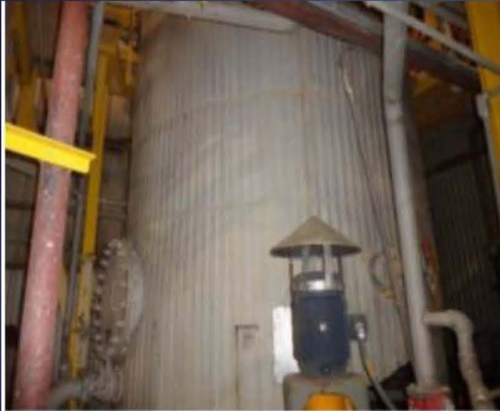
Item 29 – Kirk & Blum S/S Bleach Tank