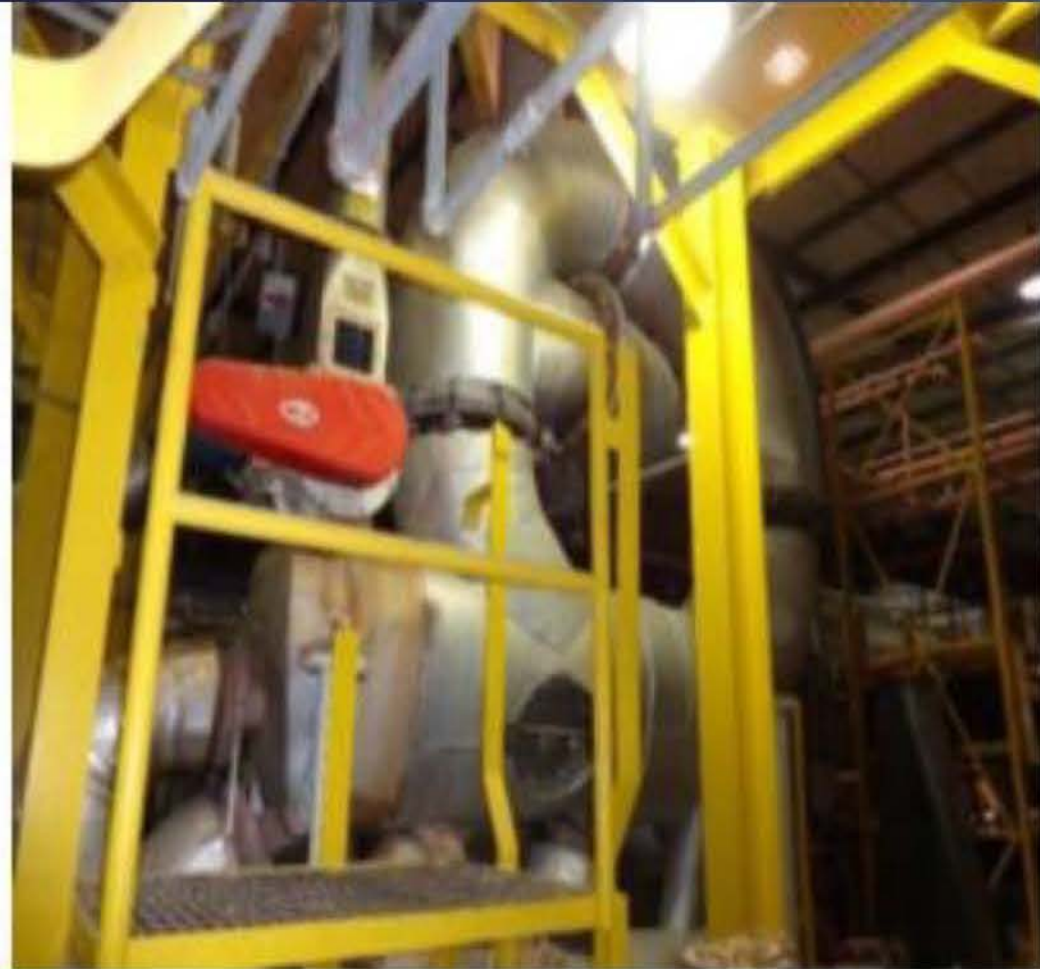
Item 49 – Fluid Energy Aljet Ring Dryer (#1)