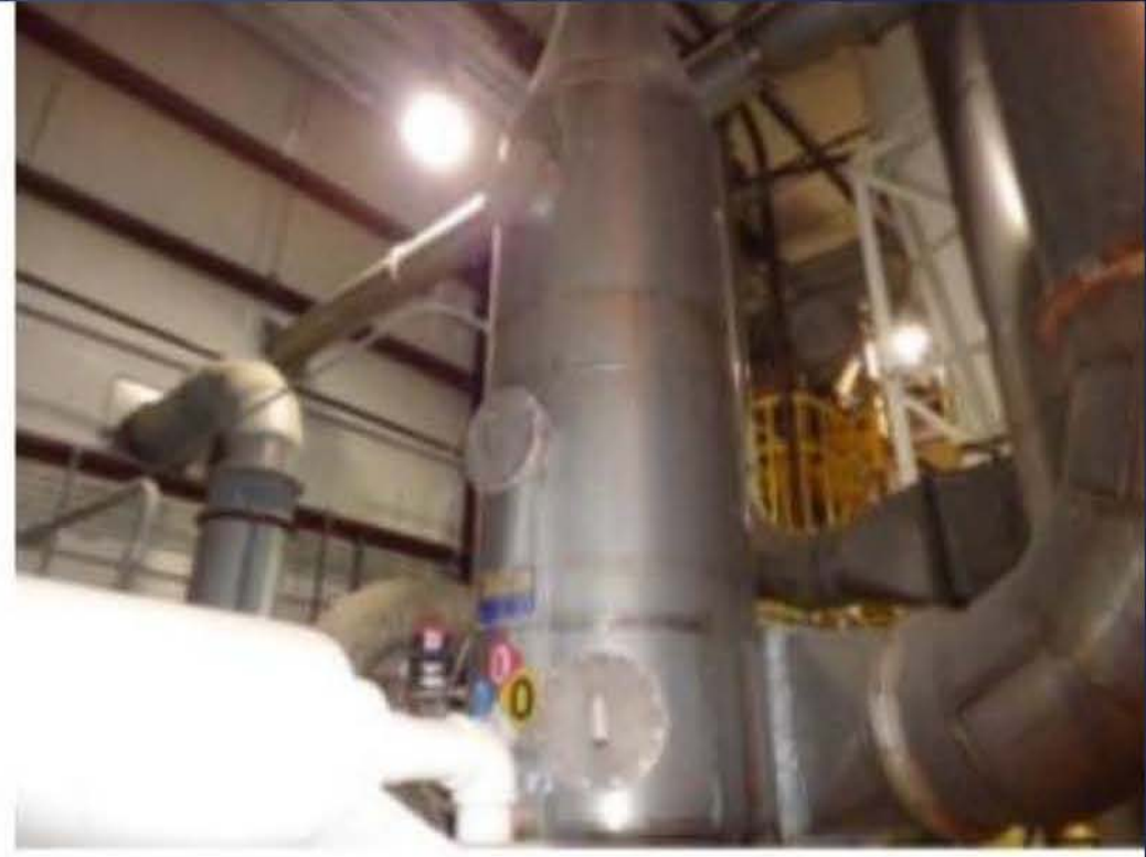
Item 53 – Ducon Scrubber Column