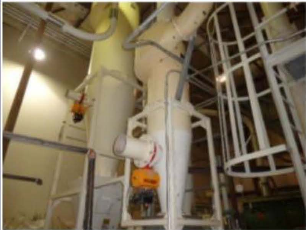
Item 91 – Fisher-Klosterman Cyclone Separator