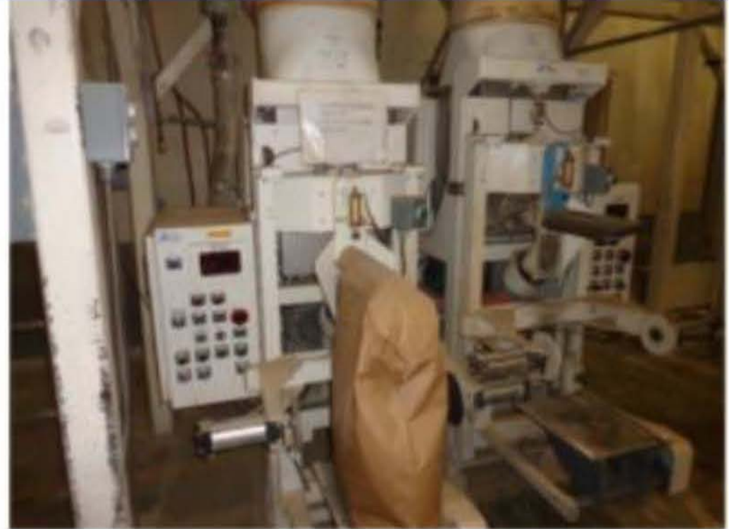
Item 112 – Paper/Poly Bag Packaging System