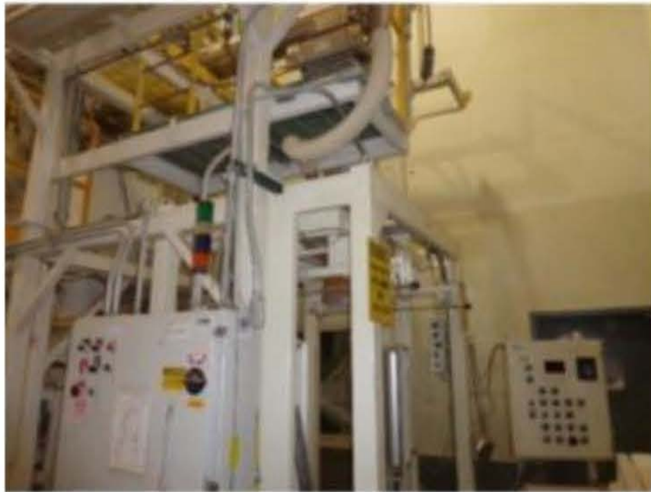
Item 113 – Bulk Bag Packaging System