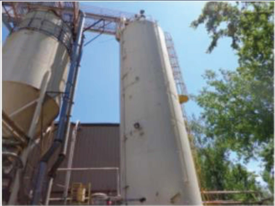
Item 1 – Welded Carbon Steel Silo