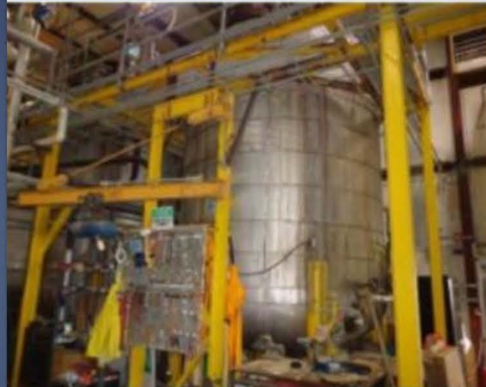
Item 24 – Quality Containment Digester Tank